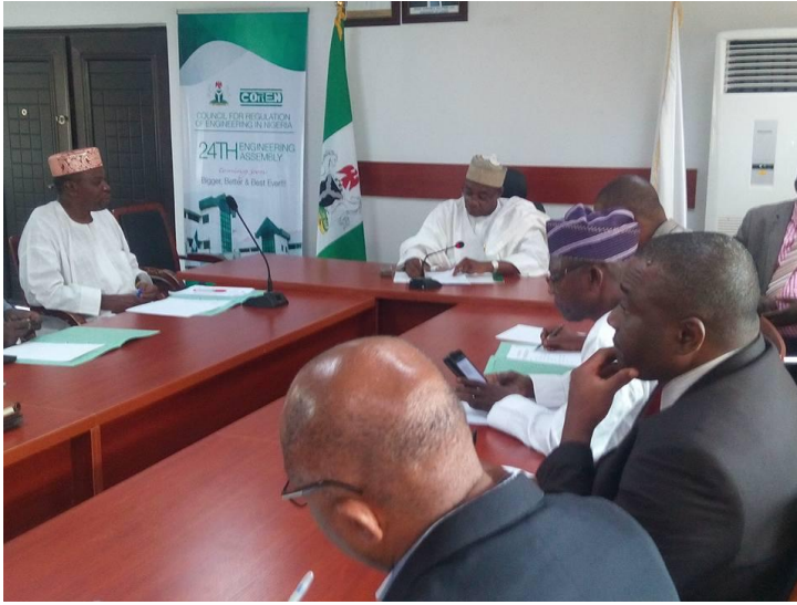
PHOTO SPEAK - MEETINGS