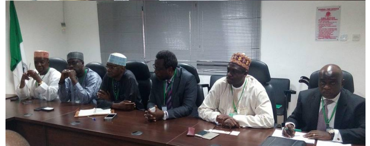
ACEN and African Development Bank