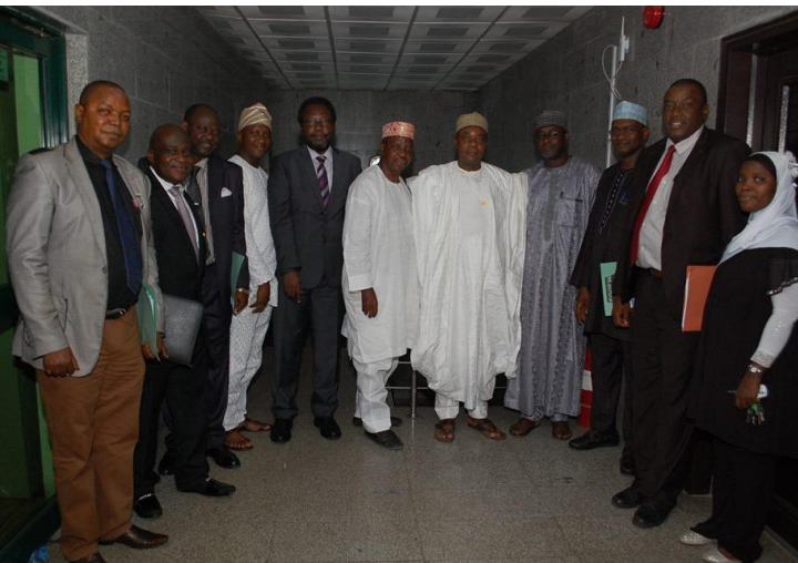
COREN/ ACEN parley of 21 Oct 2015 on Cases of illegal Practice by quacks and unregistered engineering consultants.